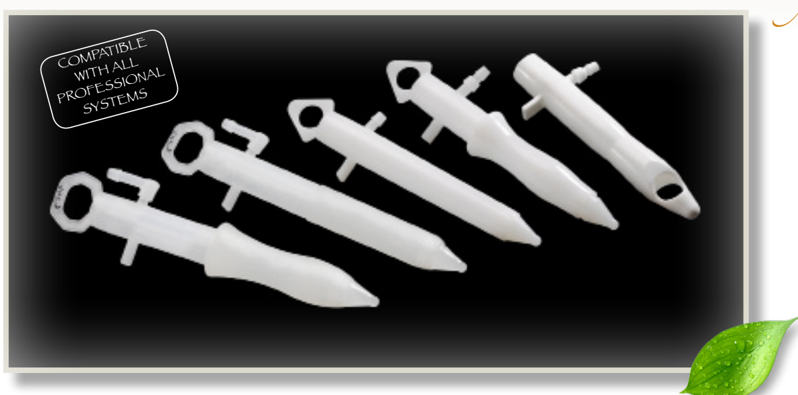
Over 15 Million kits sold only confirms that innovation, quality, safety and efficiency are valued around the world.

INCREASED AWARENESS of the many benefits of Professional Colon Hydro-therapy have made it one of the fastest growing health care modalities.